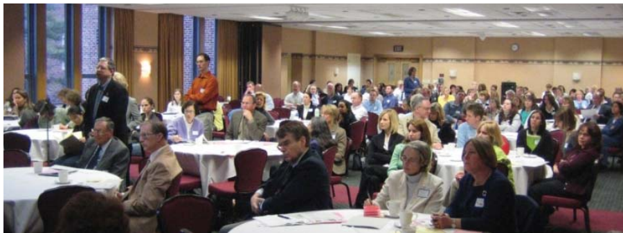
Conference attendees listen to the morning sessions. Close to 200 people attended.

The Epidemiology Section would like to thank all of the conference attendees and sponsors for making this one of the most successful Epidemiology Conferences to date. More information on the conference, including poster abstracts, presentations, and photos can be found on the Epidemiology Section's web page at http://www.mipha.org/epi/Conf2008/ConfAgenda2008.html .